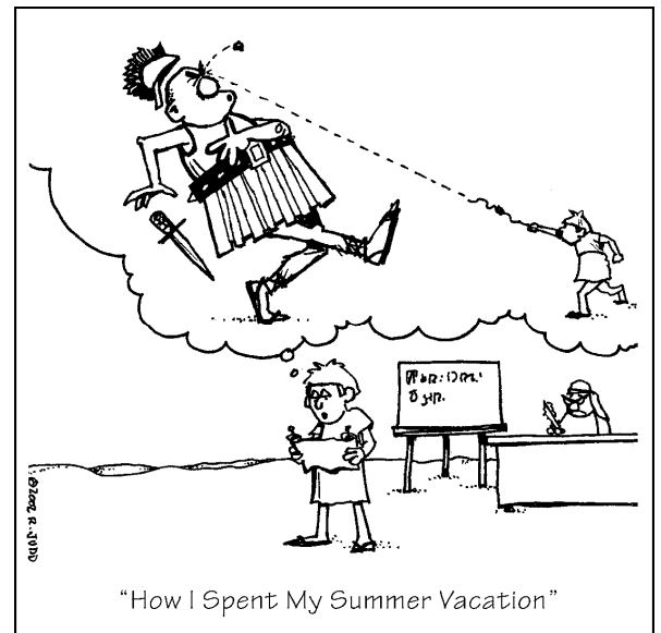
"How I Spent My Summer Vacation"