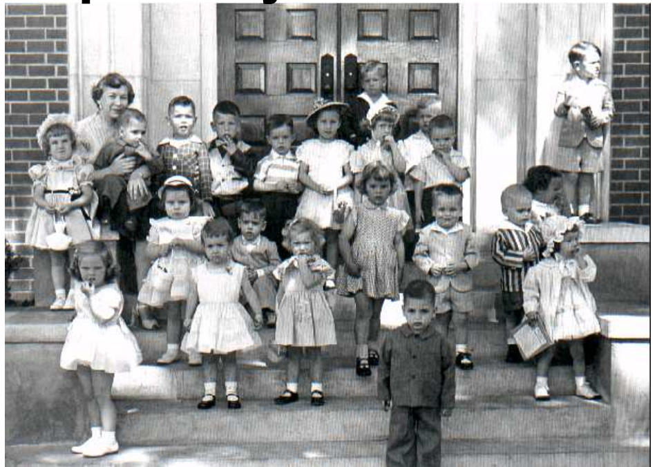
Our Church Historian is trying to identify these people. If you could help identify someone we might not know, please call the church office. The pic was made in the '50s.