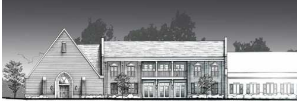
Dallas Street Elevation Holmes Street Methodist Church