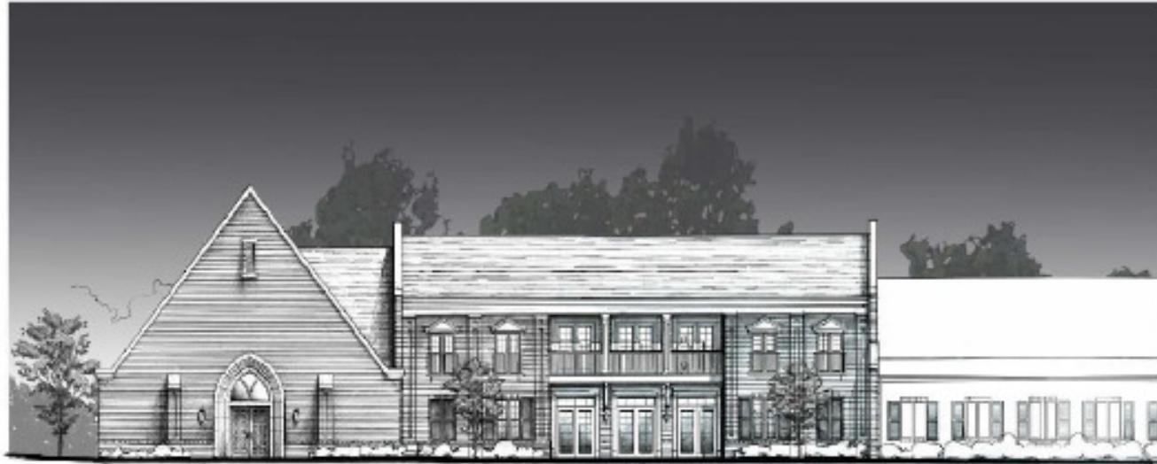
Dallas Street Elevation Holmes Street Methodist Church